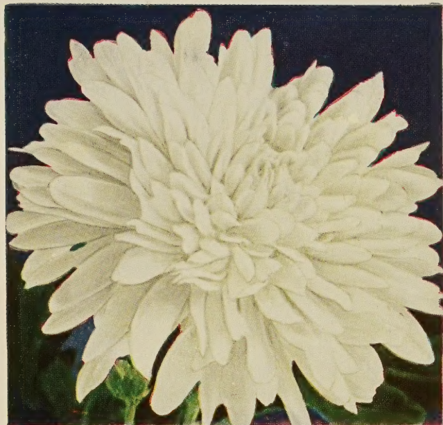
© AVALANCHE. 50c each; 3 for $1.25